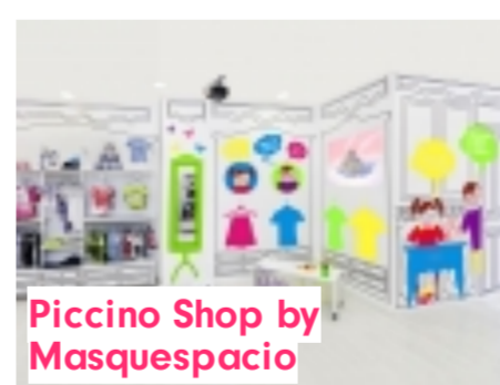
Piccino Shop by Masquespacio