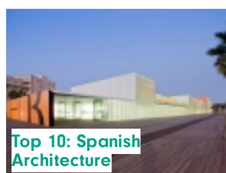
Top 10: Spanish Architecture