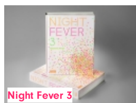
Night Fever 3