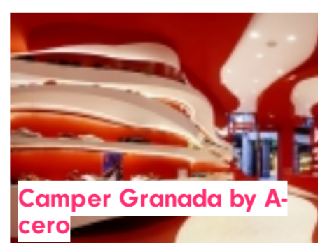
Camper Granada by A-cero